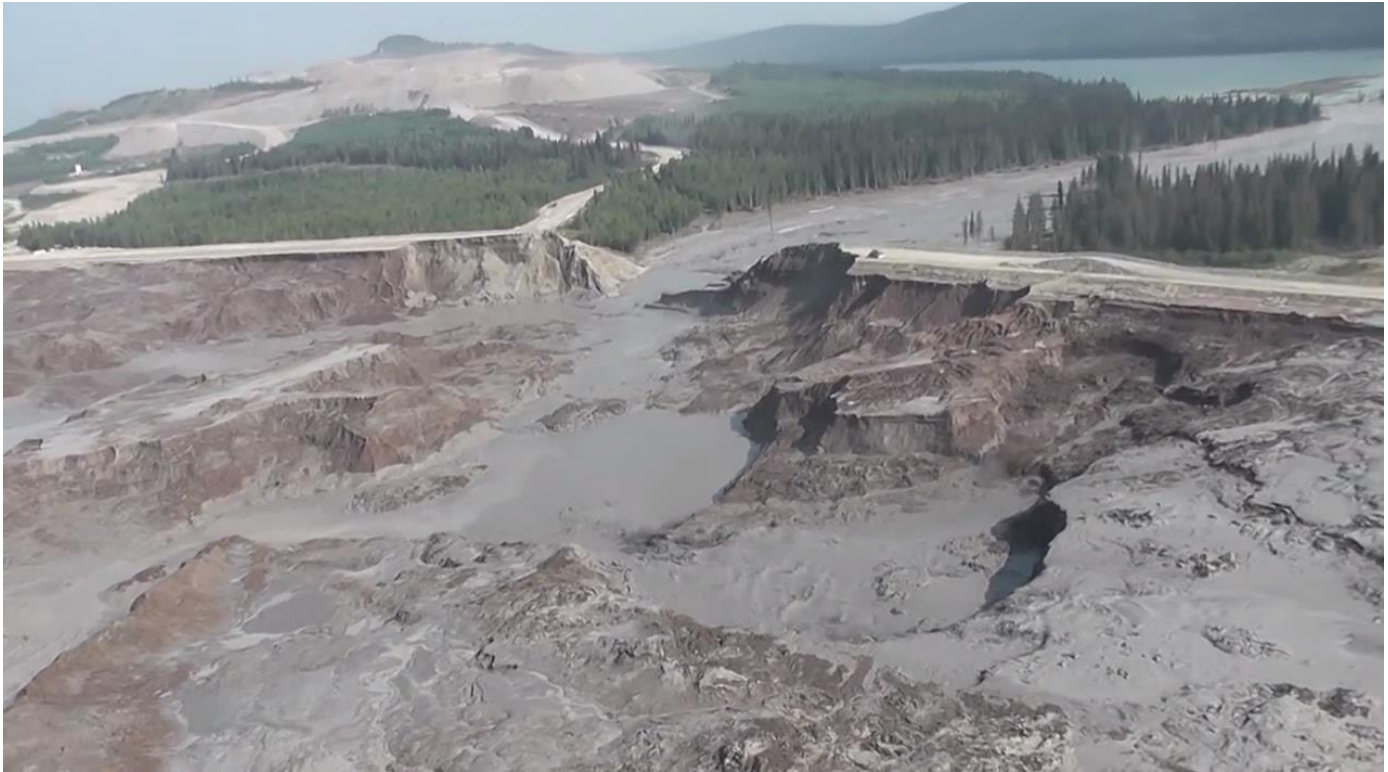
Figure 7 Disastrous environmental impacts caused by Mount Polley Tailings Dam failure

Static liquefaction is associated with fine grained soils with low hydraulic conductivity undergoes sudden loss of strength at higher stress levels and unable to drain. Under loading it contracts the soils and produces excessive pore pressure which cannot be drained effectively. Static liquefaction happens so fast, and it is an extremely dangerous phenomenon that anyone who manages and deals with tailings dams need to understand very well.