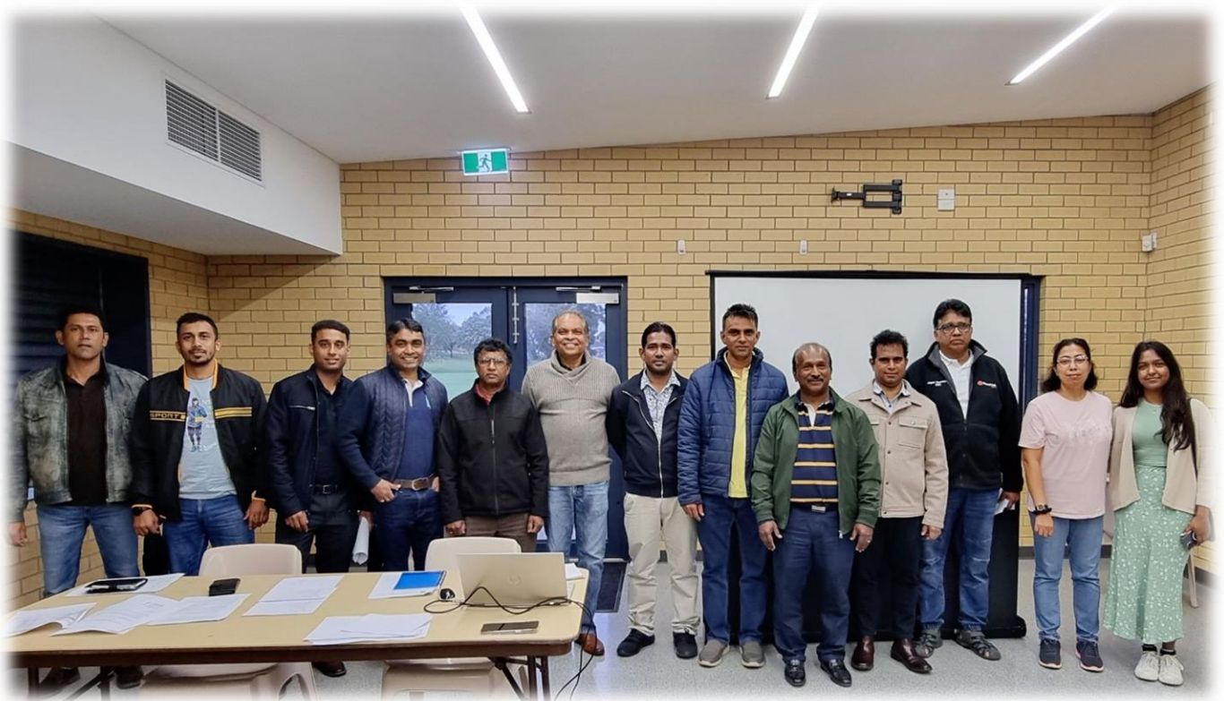
Figure 1 The new executive committee elected for 2022-2023