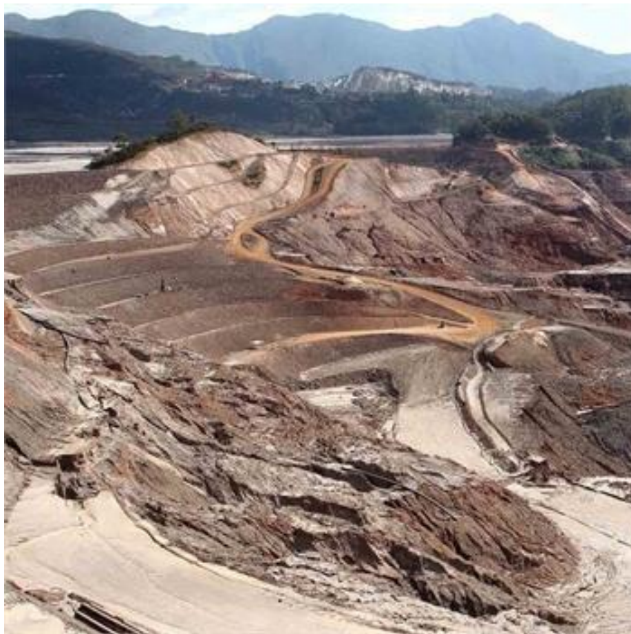
Figure 4 Fundano tailings dam after failure