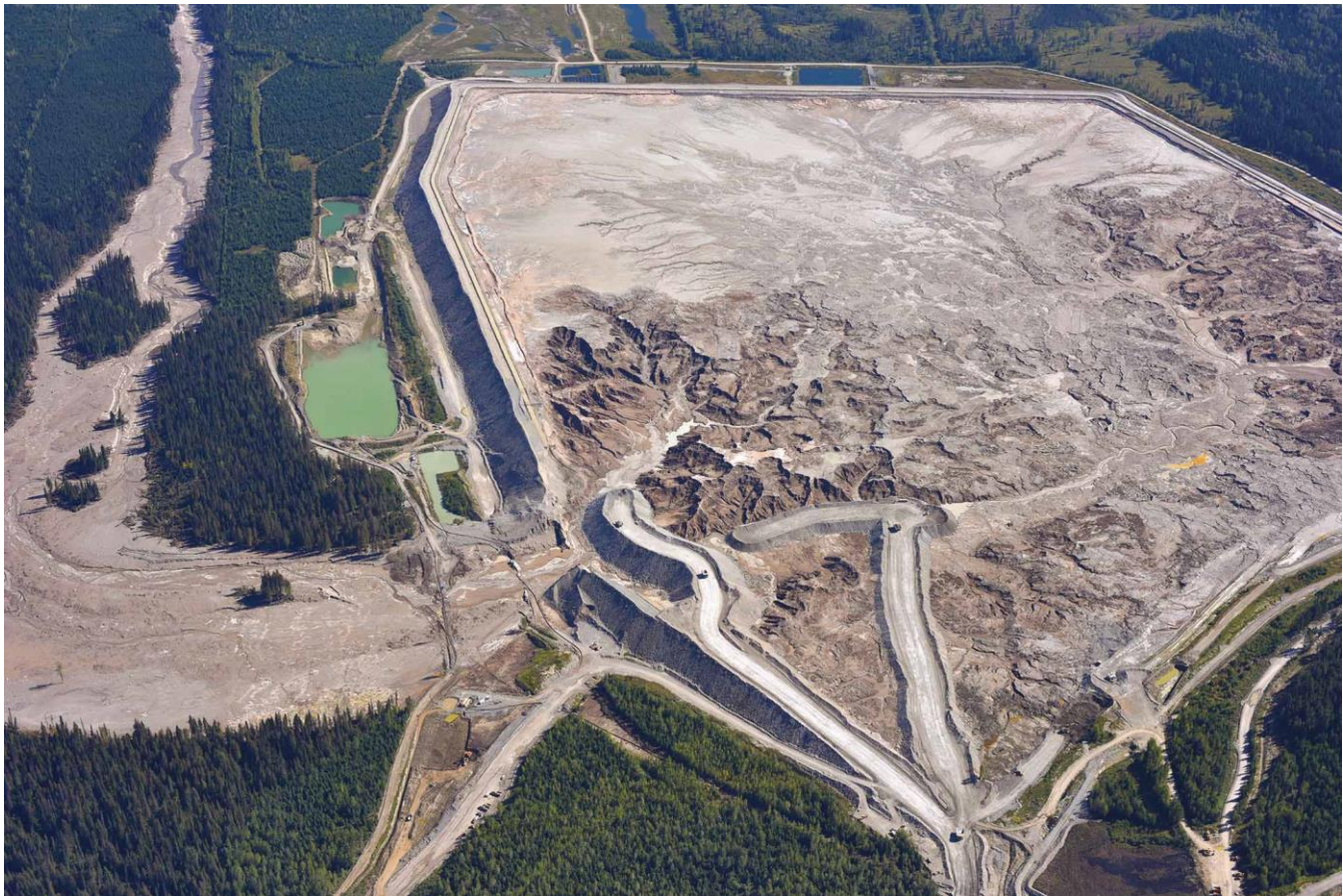
Figure 6 Mount Polley Tailings dam after failure