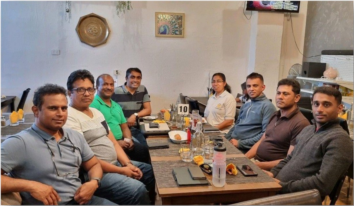
Figure 2 The first committee meeting on 22 nd November 2022