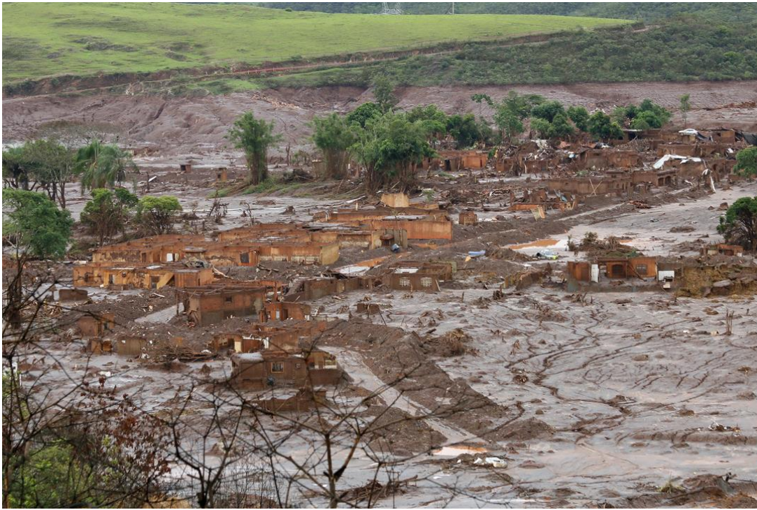
Figure 5 Environmental disaster caused by Fundano tailings dam failure